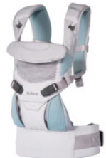
2 blocks mint grey