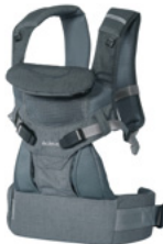
2 blocks dark grey